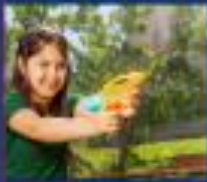
WATER PISTOLS OR ARTS & CRAFTS ?