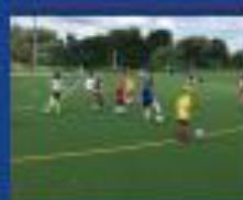
FOOTBALL OR ARCHERY ?