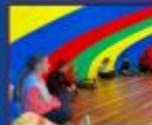
PARACHUTE OR SWIMMING ?