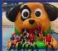
INFLATABLES OR DODGEBALL ?