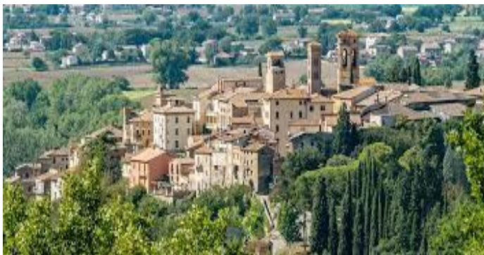
The town of Deruta

Over the years we have collected figures to make the Nativity you see in school. In Umbria a town called Deruta is famous for the production of ceramics, and one workshop only makes nativity figures. In Italy the Nativity scene is called a Presepe. First of all we got Mary and Joseph, and we made a manger out of scraps of wood. We found our baby Jesus in Spain, and our Granddaughter always puts Jesus in the manger on Christmas morning. The following year we got one of the Wise Men, and a donkey of the right size (but he came from Deans). The year after that we got two more Wise Men from the east, and a shepherdess. This year we were very pleased to be able to buy the ox and the ass to place in the stable.