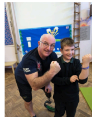
Motivational assembly with Sean Gaffney (Invictus Games & Commonwealth Games athlete)