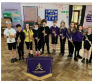
Choir and Windband Performance at the Methodist Church