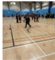
Panathlon Games Opportunity to attend fun and inclusive games.