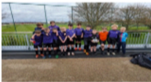
York and North Yorkshire Champions! Representing North Yorkshire in the regional finals in Liverpool.

On the sports front, our teams have achieved fantastic successes, showcasing their talent and dedication in a wide range of sports and competitions.