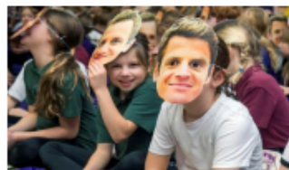
A visit from The Brownlee Brothers! The Brownlee Brothers came to school to take part in a PE lesson and Q and A session—What a day to remember!