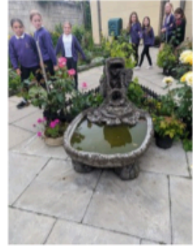
Visit to the Mosque to enhance the RE curriculum