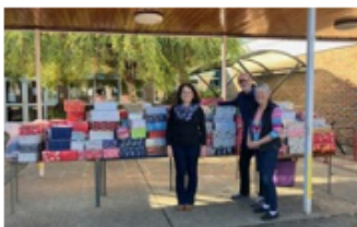
Children in Distress - Shoebox Appeal 2023 – the school community collected 202 shoe boxes and a bag full of beautiful hand-knitted hats!

Additionally, a wide range of enrichment programmes and charity initiatives have inspired our children and fostered a strong sense of community and social responsibility.